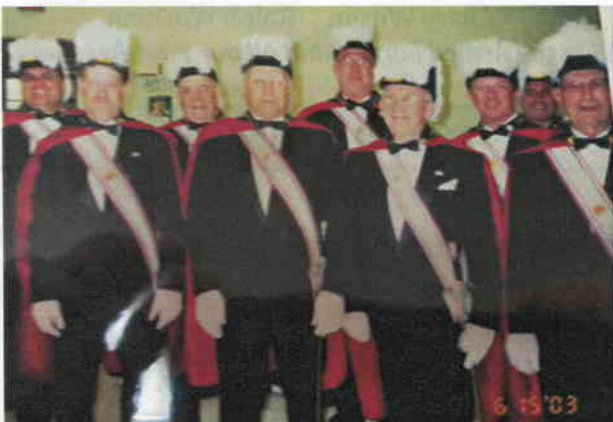
Knights of Columbus, 2003